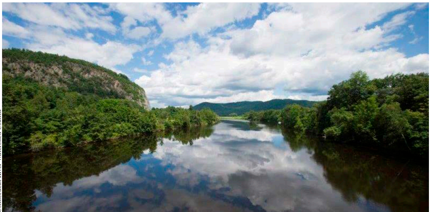
Connecticut River Watershed Council

Connect the Connecticut is a unified vision that considers the value of fish and wildlife species and the natural systems they inhabit. High quality habitat for a set of 15 fish and wildlife species —including American woodcock, black bear, and Eastern brook trout — is a key component of the network of core areas. The partnership identified these species to represent others that rely on similar habitats within the major types of natural systems in the watershed — from spruce-fir forests to small streams to freshwater marshes. By ensuring that high quality habitat for these representative species is included, the design addresses the needs of a range of fish and wildlife. Other key components of the core areas include high quality, resilient locations of both rare and common ecosystem types throughout the watershed, from Long Island Sound to the peaks of the White Mountains.